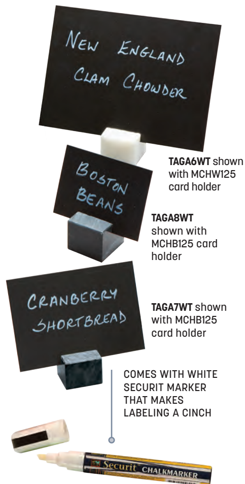
TAGA6WT shown with MCHW125 card holder