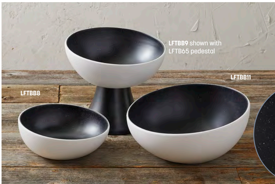
LFTBB9 shown with LFTB65 pedestal