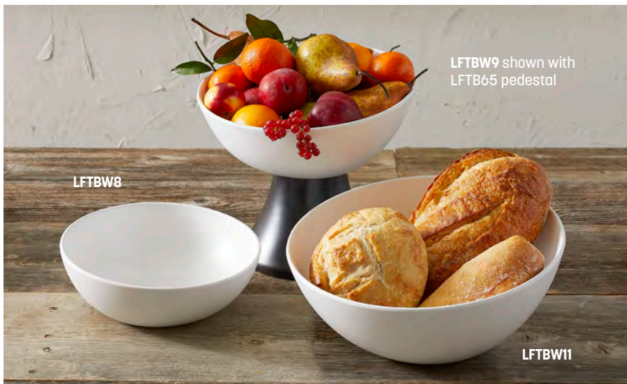
LFTBW9 shown with LFTB65 pedestal