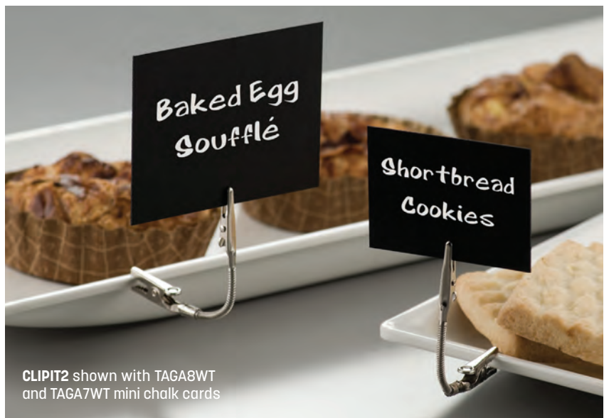
CLIPIT2 shown with TAGA8WT and TAGA7WT mini chalk cards