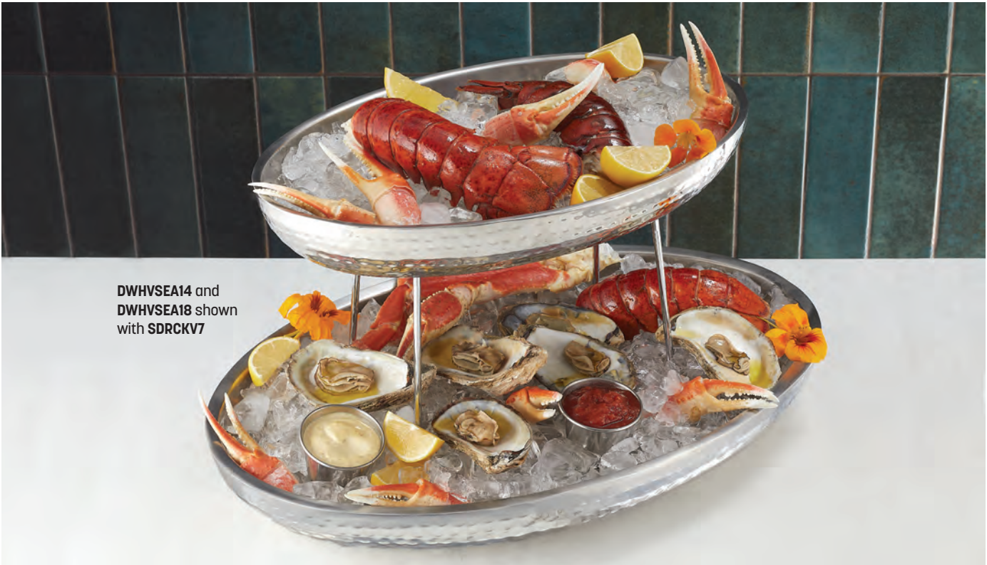
DWHVSEA14 and DWHVSEA18 shown with SDRCKV7