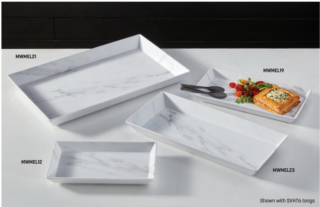
Shown with SVHT6 tongs