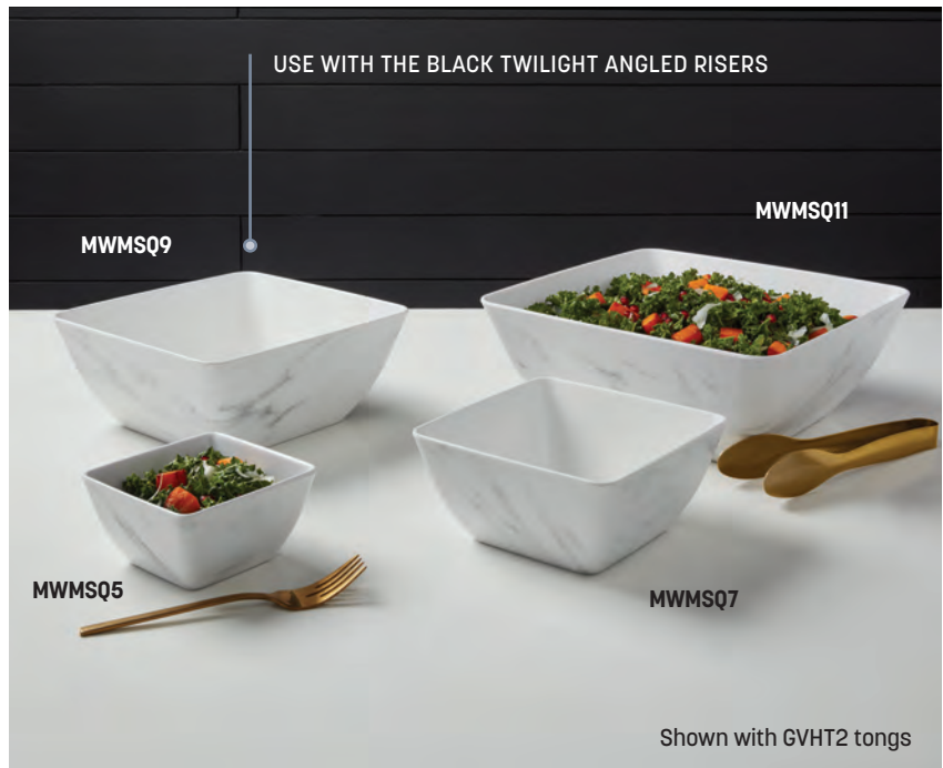
Shown with GVHT2 tongs